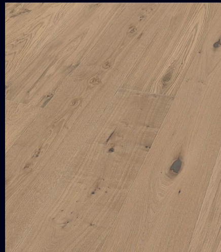
Authentic pure greige oak 20018