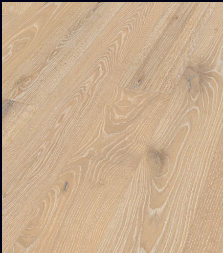
Limed light white oak lively 20016