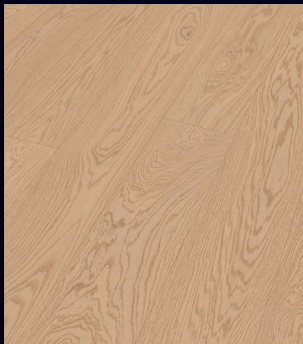
Natural light oak 20079