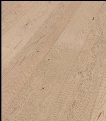
Off-white oak lively 20014