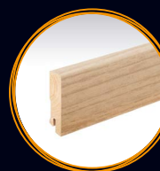
Matching skirting board 15 F MK profile