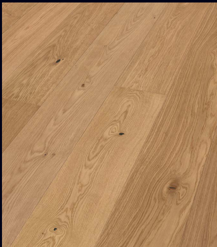
Oak lively 20013