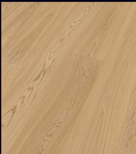
Natural pure oak 20078