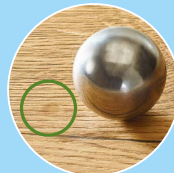
Wood flooring Natureflex