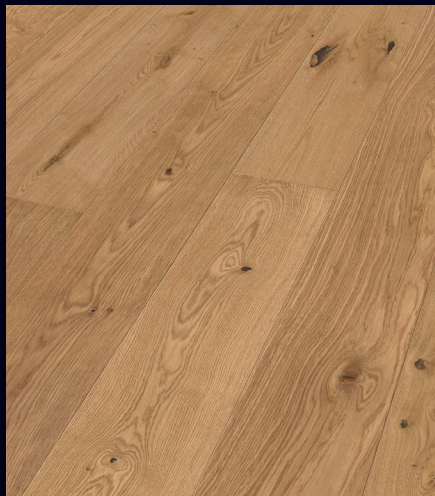
Authentic oak 20017