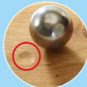
Standard parquet flooring

Had the odd spill or accident? Not a problem! Natureflex HD 100 is considerably sturdier than standard parquet flooring, and it's indent- and stain-resistant.